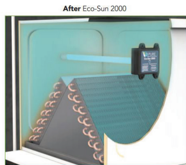
The Eco-Sun 2000's germicidal UV light prevents mold, bacteria and virus infestation and the clean coil will operate at optimum efficiency, saving energy.