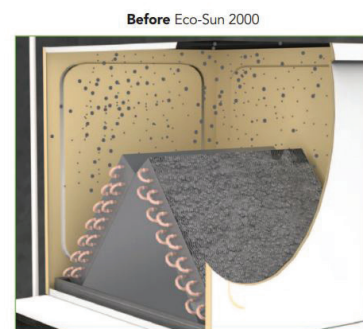
Mold commonly grows on wet HVAC cooling coils and surrounding areas producing mold allergen (spores) and insulating the coil, wasting energy.